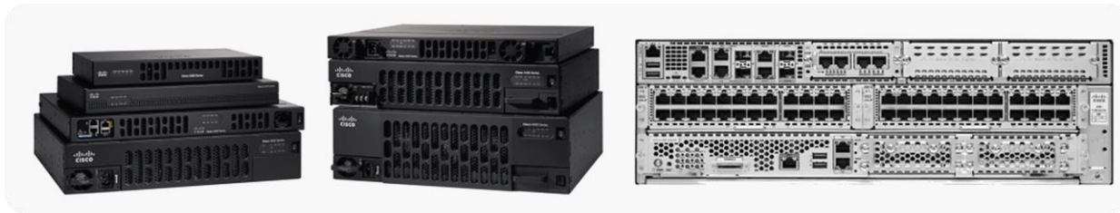
Figure 1. Cisco 4000 Series Integrated Services Routers

The Cisco 4000 Family contains the following platforms: the 4461, 4451, 4431, 4351, 4331, 4321 and 4221 ISRs.