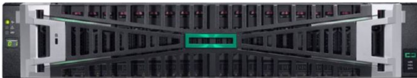
HPE MSA Gen7 Storage - Front View

HPE MSA Storage has been the leading shared storage solution for HPE ProLiant Servers for almost three decades. With over 600,000 storage arrays sold, MSA continues to deliver on its promise of simple, fast, and affordable storage for SMB customers. The MSA Gen7 storage array sets a new standard for entry-level shared storage by providing an affordable path to high-performance storage without compromising on the simplicity and reliability that its customers depend on. The MSA Gen7 array portfolio delivers up to 2X more system performance while supporting user scalability beyond 7 PB per array with new high-capacity media options. New Gen7 innovations supporting online system and media firmware updates, as well as simpler and faster access to the HPE MSA Health Check tool, reduce the complexity, and time required for routine system maintenance.